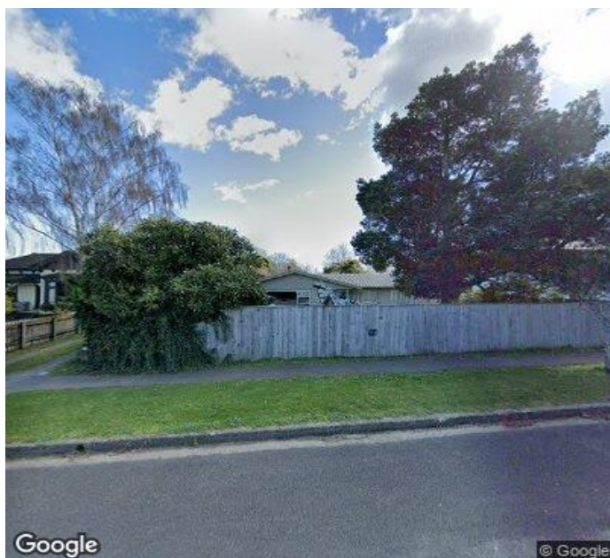
Google Streetview Image